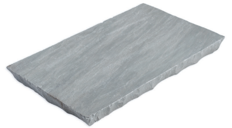
Appalachian Grey Artisan Cap