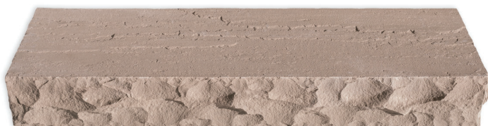
Autumn Brown Classic Steps

Featuring natural cleft tops and hand-split bottoms, our Classic Steps can be used to create beautiful and long-lasting stairways in any landscaping project.