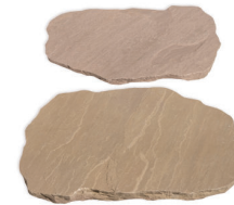
Autumn Brown Stepping Stones