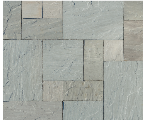
Grey Classic Flagstone