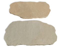
Tennessee Tan Stepping Stones