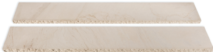
Yorkshire Signature Treads