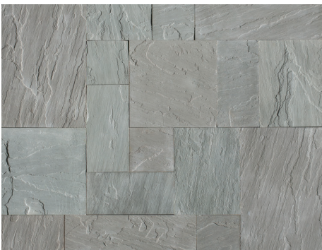
Grey Mist ArtisanCut Flagstone

ArtisanCut Flagstone has the same top and bottom finish as Artisan Flagstone. Instead of rockfaced edges, ArtisanCut Flagstone has sawn edges, allowing for smoother and more consistent mortar joints.