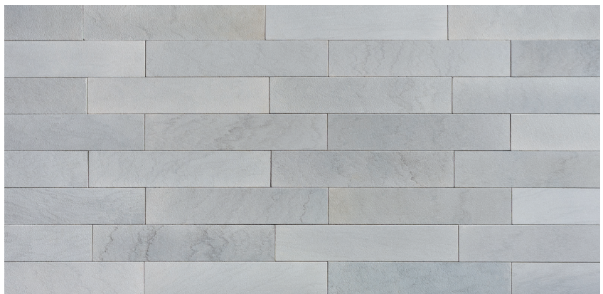
Arctic Grey MetroFit