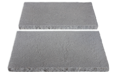
Summit Blue Signature Caps