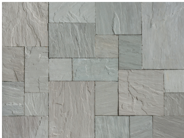
Appalachian Grey Artisan Flagstone