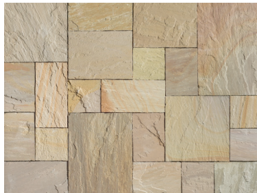
Tennessee Tan Artisan Flagstone