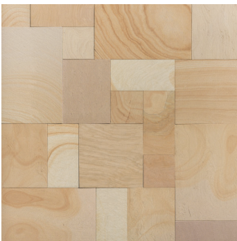
Sahara Signature Flagstone

Signature Flagstone features sawn edges and a sawn and lightly textured surface. With four luxurious color blends, it adds beauty and elegance to any project. The sawn and textured finish allows for easy installation and a precise appearance.