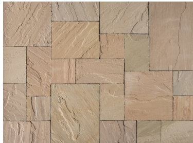
Autumn Brown Artisan Flagstone

The perfect choice for your patio, walkway, or porch. The best of both worlds — ease of installation, and the beauty of a natural stone surface.