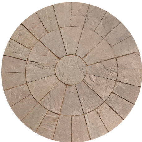
Autumn Brown Artisan Flagstone Circle

Circle packs are a beautiful way to add an accent or focal point to a flagstone patio. They include a square-off kit (not pictured) for easy installation.