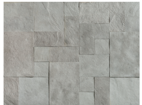
Colonial Grey ArtisanCut Flagstone