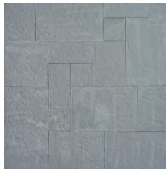
Summit Blue Signature Flagstone