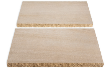
Sedona Buff Signature Caps