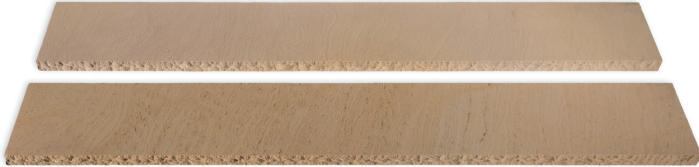
Sahara Signature Treads