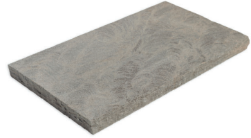
Sable Signature Cap