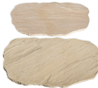
Tennessee Tan Pathway Stones