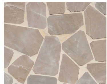
Autumn Brown Artisan Irregular Flagstone

Featuring the same calibrated bottom as regular Artisan Flagstone, our Irregular Flagstone creates a unique natural look while maintaining ease of installation.