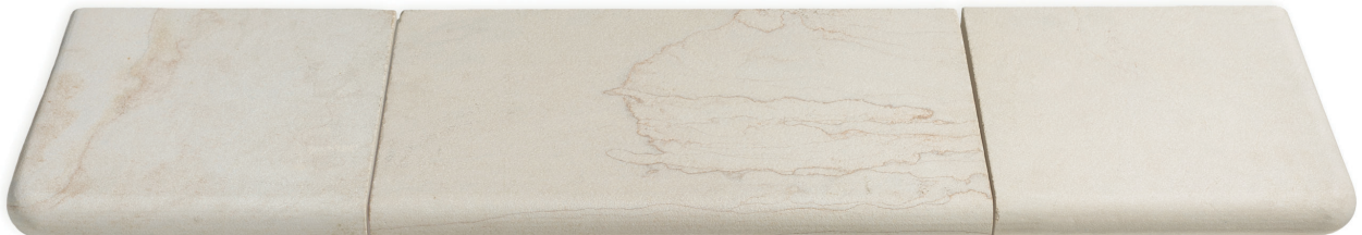
Yorkshire Signature Bullnose (Straight & 2 Corners)

A beautiful choice for hearths and step treads, Signature Bullnose is available in straight pieces (3 sawn edges and one smooth rounded edge) and corner pieces (2 sawn edges and 2 smooth rounded edges).