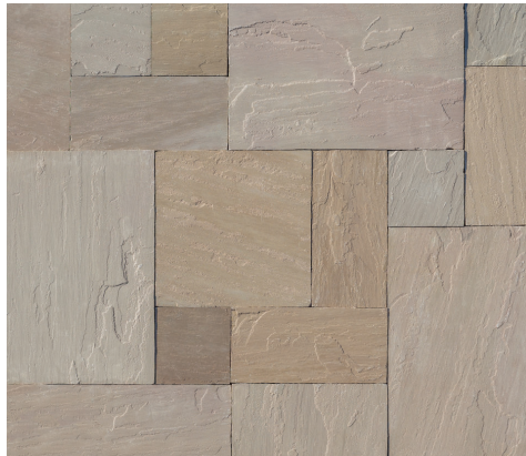
Brown Classic Flagstone

Featuring natural cleft tops, hand-split bottoms, and hand-cut rockfaced edges, Classic Flagstone provides a high quality finish without sacrificing affordability.