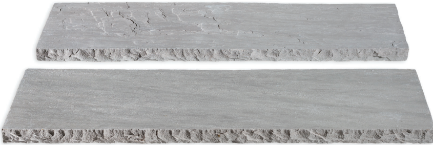
Appalachian Grey Artisan Treads