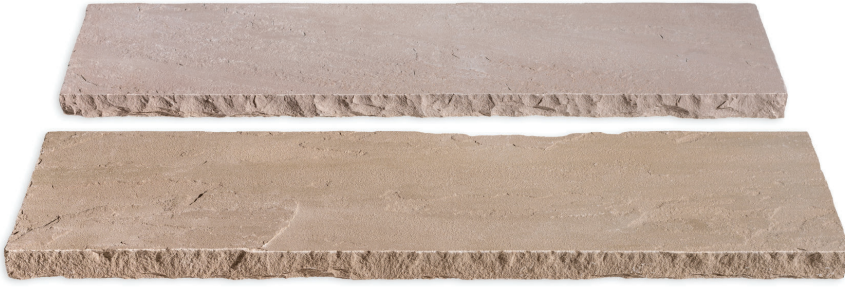
Autumn Brown Artisan Treads

Beautiful and durable, Artisan Caps and Treads are an exceptional choice for step treads, wall caps, fireplace hearths, and more. All 4 edges of each piece are rockfaced.