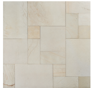
Yorkshire Signature Flagstone