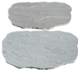
Grey Pathway Stones