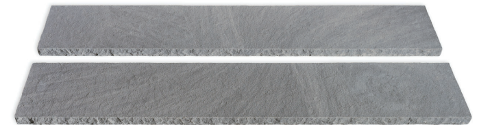
Summit Blue Signature Treads