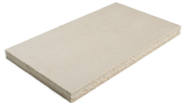
Yorkshire Signature Cap