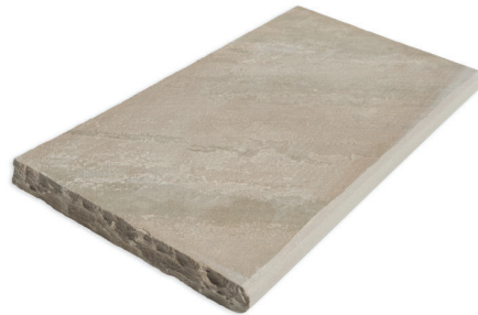
Autumn Brown Bullnose

Featuring 3 rockfaced edges and one smooth rounded edge, our Artisan Bullnose is an excellent choice for fireplace hearths and step treads.