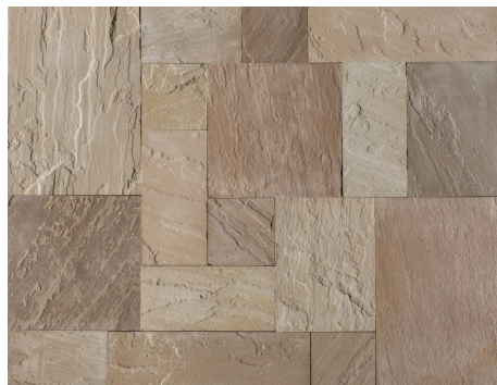
Harvest Gold ArtisanCut Flagstone