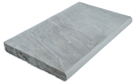
Appalachian Grey Bullnose