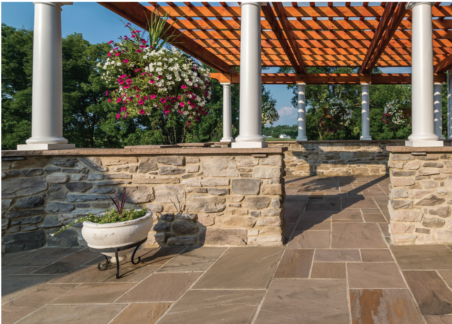
Autumn Brown Artisan Flagstone

Visit our website for more product details, FAQs, inspirational photos, and to contact us if you have any questions.