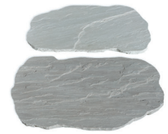
Grey Stepping Stones