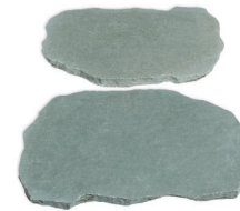
Indian Blue Stepping Stones