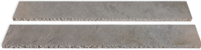
Sable Signature Treads

Signature Caps and Treads add the perfect finishing touch to any project. With a variety of sizes available, they can be used as wall caps, fireplace hearths, step treads, and more. Each piece has 4 rockfaced edges.