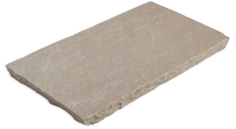
Autumn Brown Artisan Cap