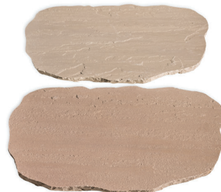
Autumn Brown Pathway Stones

Featuring a natural cleft top and bottom, our Classic Stepping Stones, Pathway Stones, and MiniSteppers are used to create elegant walkways through flower beds, gardens, and yards.