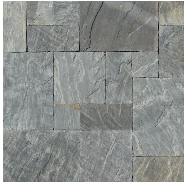
Sable Artisan Flagstone