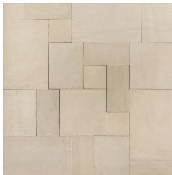
Sedona Buff Signature Flagstone