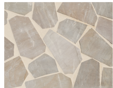
Tennessee Tan Artisan Irregular Flagstone