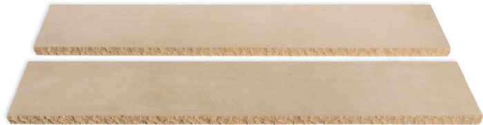
Sedona Buff Signature Treads